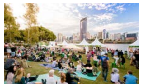
REGIONAL FLAVOURS Brisbane, Queensland