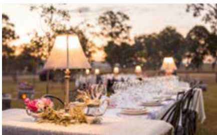
EAT LOCAL WEEK Scenic Rim, Queensland