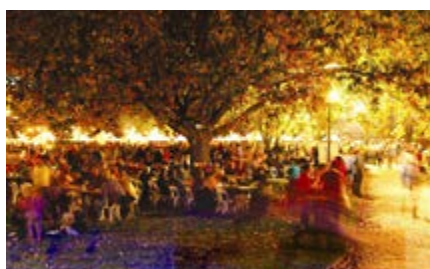
ORANGE F.O.O.D. WEEK Orange, NSW